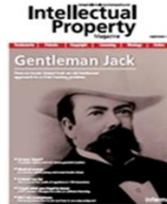
License to Print Money