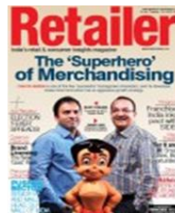
Mickey & Miffy are Retailer Friends