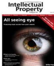
The Transforming World of Licensing