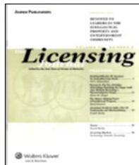
The Money Making Power of Licensing